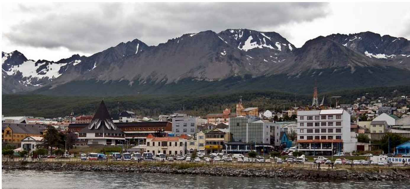
Ushuaia