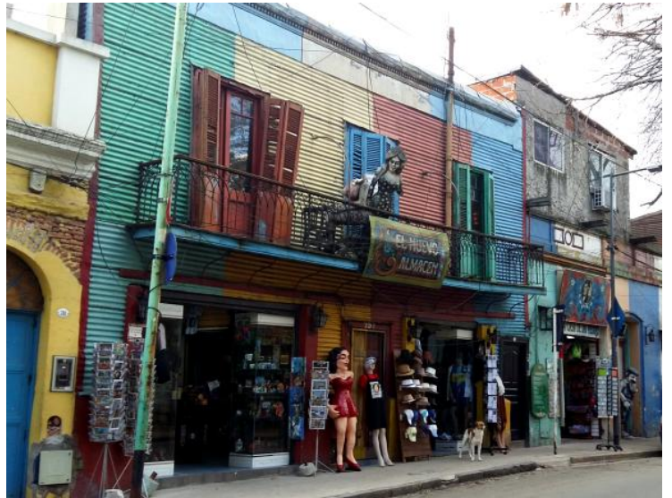
La Boca neighbourhood