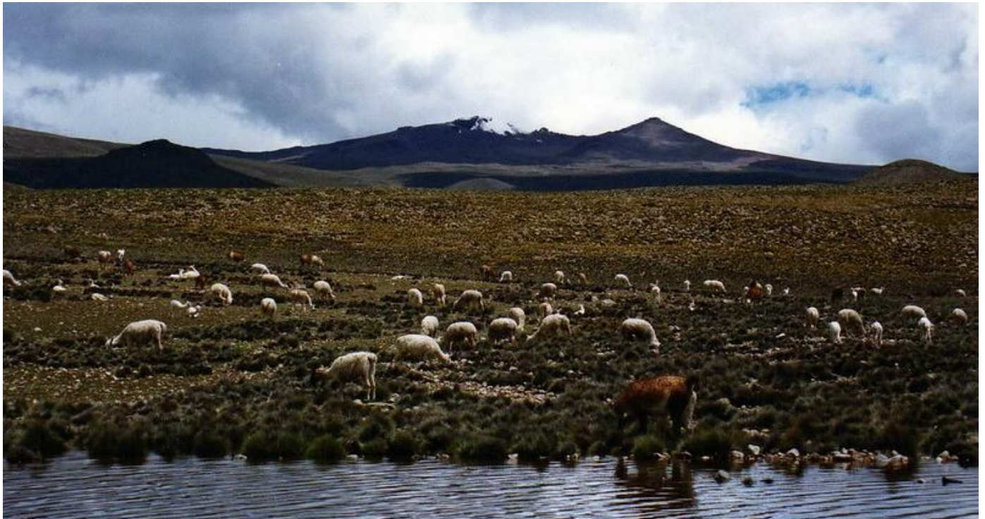
Guanacos in Tierra del Fuego National Park

Roca lakes, the second of which opens into Lapataia Bay on the southern coast, a popular point for treks. The park has dramatic scenery, with waterfalls, forests, mountains and glaciers. The park's topography is wide-ranging with mountains, rivers, valleys and lakes. It is very rich in flora and fauna with an ample variety of species. After walking through lengas forests (southern beech trees), viewing beaver dams and admiring some wild animals and birds of this region, you will arrive at Lapataia Bay where the National Route No.3 ends, together with this tour. Overnight in Ushuaia.