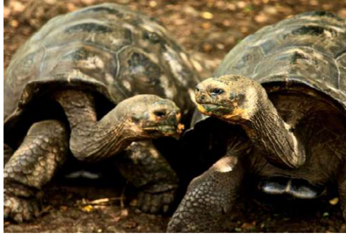
pm - San Cristobal Airport

Duration: 40-minute bus drive to the Reserve / 1-hour visit