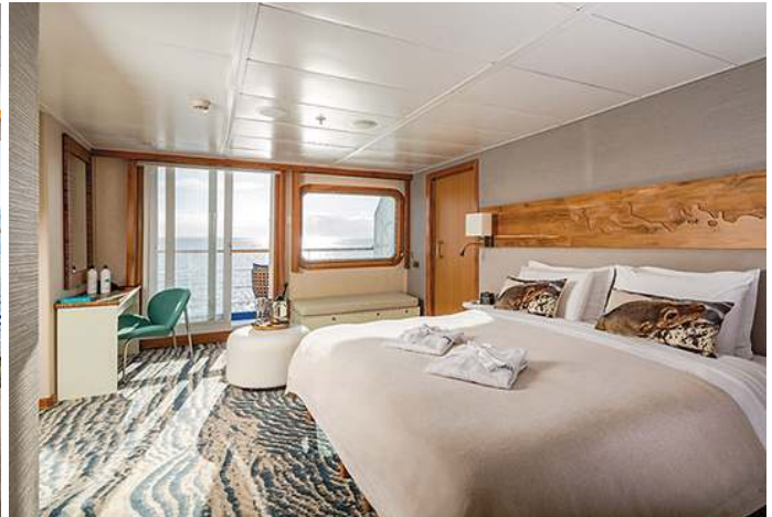
BALCONY SUITE - panoramic windows & private balcony 9 on the Moon Deck, 8 on the Sky Deck