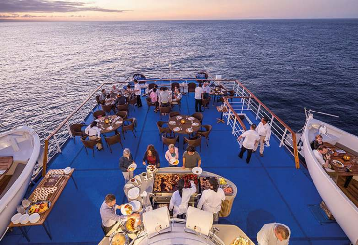
Dining Al Fresco