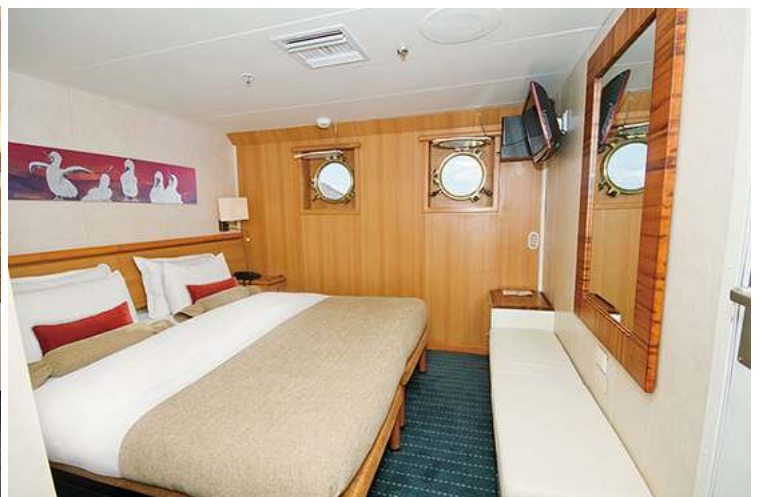
STANDARD : 3 on Earth Deck, interior cabins STANDARD PLUS : 7 on Sea Deck & Earth Deck with portholes