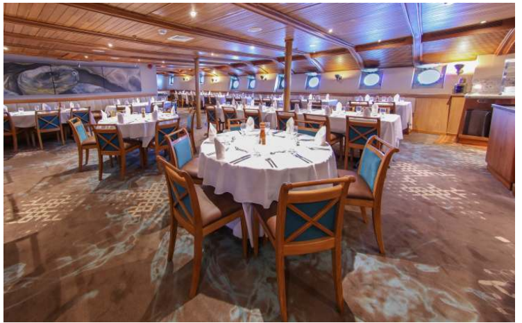
Lonesome George Restaurant