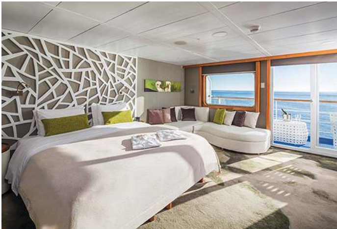
LEGEND BALCONY SUITE – large private balcony 1 on the Earth Deck

The Balcony suites have private balconies and panoramic windows to immerse yourself within the vast landscape you are about to witness and enjoy it privately. The Junior suites have three meters of panoramic windows to enjoy the passing scenery.