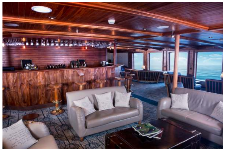
Charles Darwin Panorama Lounge Bar