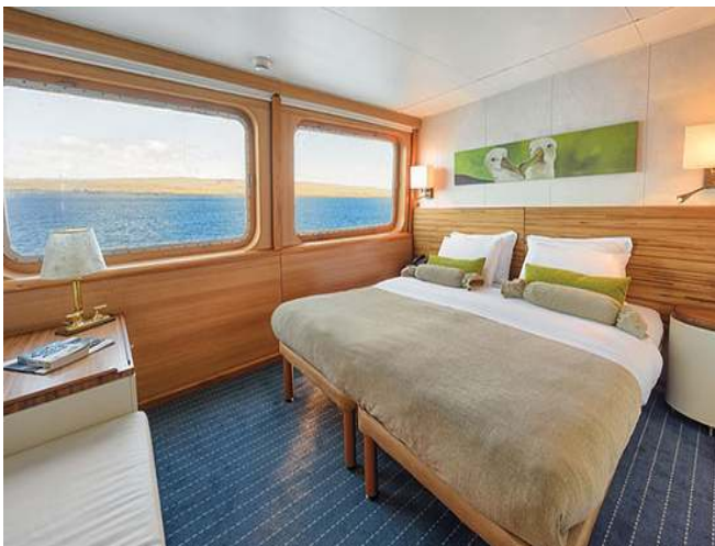
JUNIOR SUITE with big panoramic windows 1 on the Moon Deck